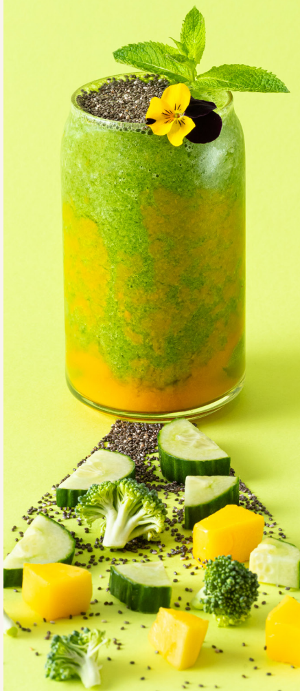
THE ISLANDER (PB) 5.5

Mango, banana, broccoli, pineapple, spinach, cucumber, fresh mint, apple juice & chia seeds