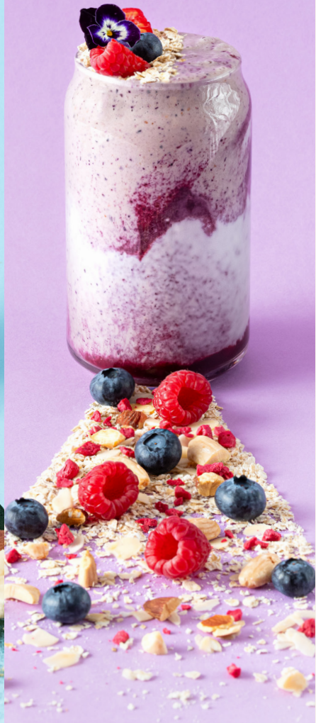
THE ENERGISER (PB) 5.5

Fresh bananas, almonds, spirulina powder & milk