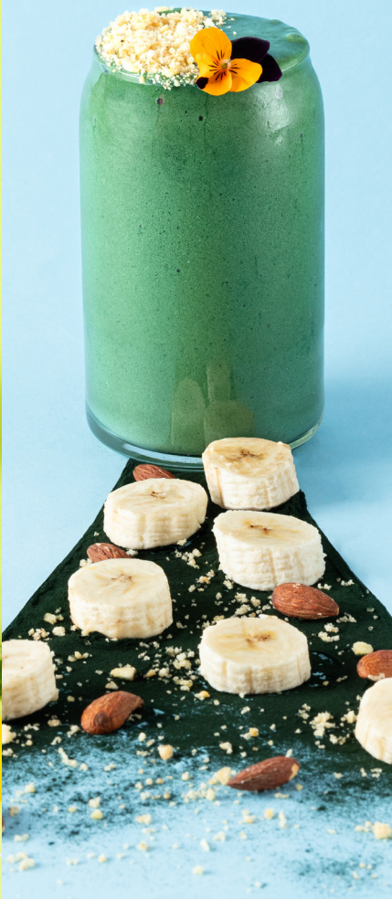
SUPER GREEN (V) 5.5

Mango, banana, broccoli, pineapple, spinach, cucumber, fresh mint, apple juice & chia seeds